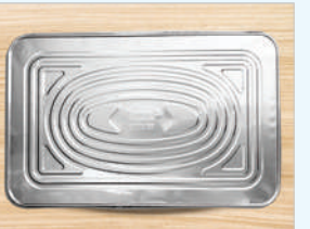
CODE :- FULL SIZE PAN LID