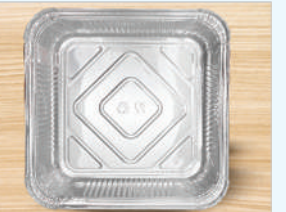
CODE :- NO 9X9X1.5 SHALLOW