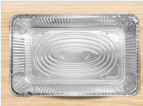
CODE :- FULL SIZE DEEP PAN