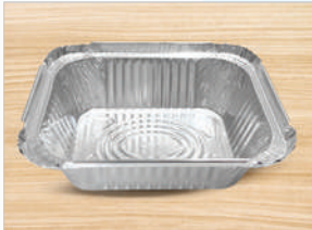
CODE :- NO 1