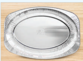
CODE :- 21" LARGE PLATTER