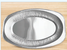
CODE :- 17" MEDIUM PLATTER