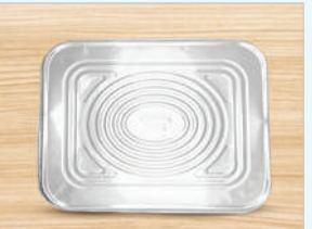
CODE :- HALF SIZE PAN LID