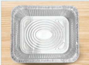
CODE :- HALF SIZE DEEP PAN