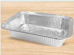
CODE :- 911