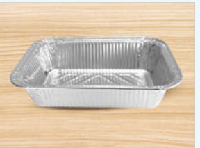
CODE :- 1050