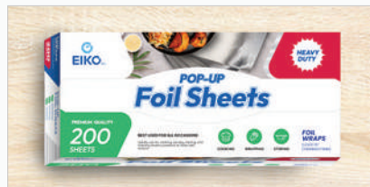
Pop Up Sheets

All Products available in multiple widths, gauges, and roll lengths, with private labelling and customization options.