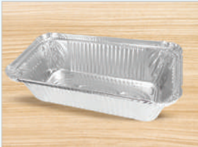
CODE :- NO 6A