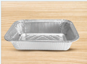
CODE :- 850