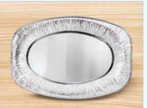
CODE :- 14" SMALL PLATTER