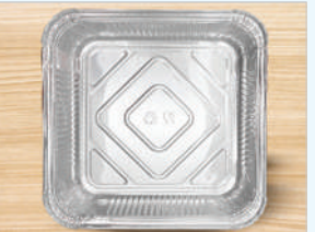
CODE :- NO 9X9X2 DEEP