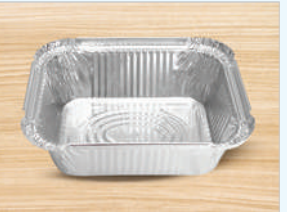
CODE :- NO 2E